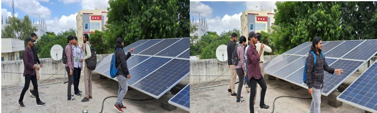
Analysis of the Solar Panels