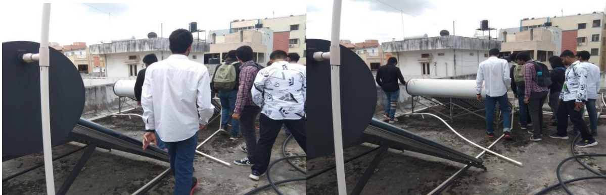
Examination of the Water Heating System

Discussion with Staff on Cooking Charges