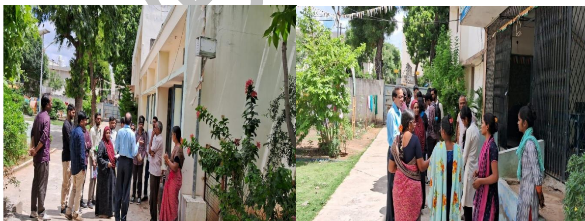
Interaction with the staff