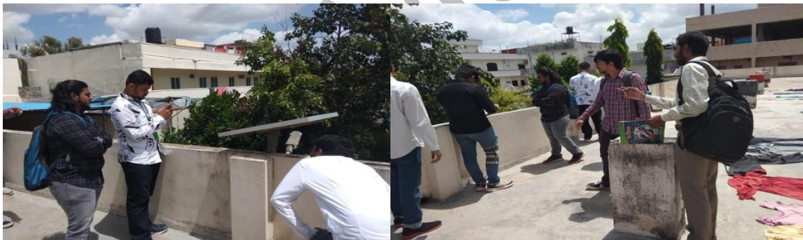
Observation of Solar Panel on Light Poles